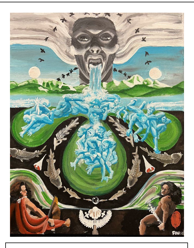
Finn Toews (Gr 12) won third place in the grade 8-12 Visual Art Category